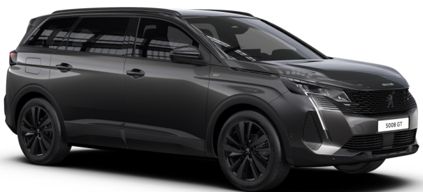
Nimbus Grey (M0VL) — metallic