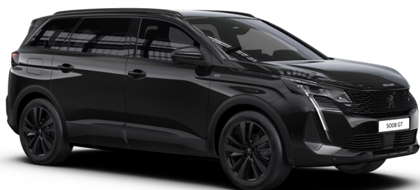
Nera Black (M09V) — metallic