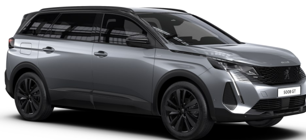
Cumulus Grey (M0F4) — metallic